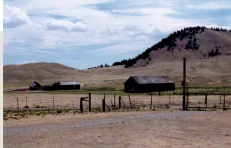
Saltworks Ranch, Park County

(Please see page 7, "How Can I Transfer a Colorado Conservation Tax Credit?")