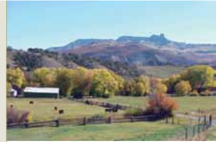
Hart Ranch, Montrose County

(Please see page 10, "The Legislative Landscape & The $26M Credit Cap.")