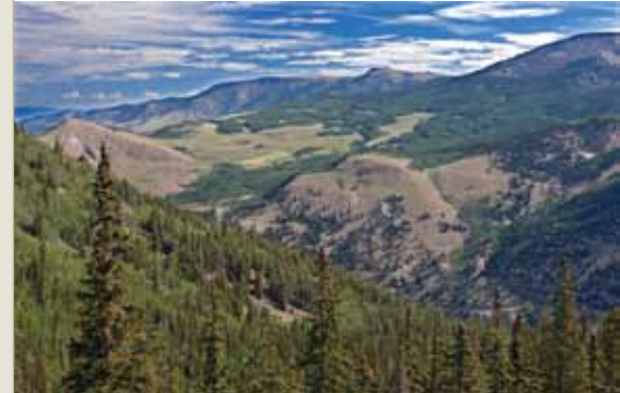
Vickers Ranch, Hinsdale County

The ability to transfer Credits has enabled many landowners to protect important conservation and agriculturally significant areas in Colorado – landowners who would otherwise be financially unable to preserve their land through a conservation easement.