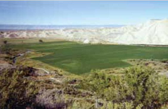
Kehmeier Ranch, Delta County