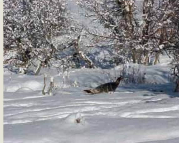
Hart Ranch, Montrose County