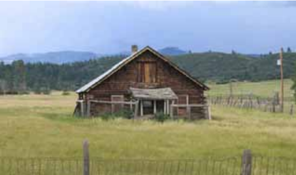
Hott Ranch, Archuleta County

Transferring a Colorado Conservation Tax Credit involves a complex area of law with rules and regulations that are continually evolving. Questions that may help you select an appropriate facilitator include: