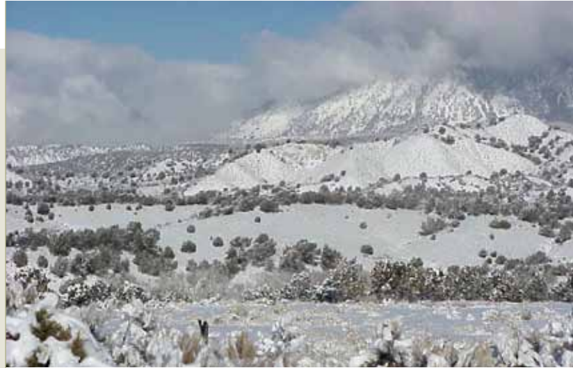
Hart Ranch, Montrose County

The Colorado Conservation Tax Credit (Credit) is a state income tax credit of up to $375,000 available to a landowner who elects to place a conservation easement on his or her land. A conservation easement is a written agreement between a landowner and a land trust or local government open space program that preserves the conservation and, if applicable, agricultural values of the land. At the same time, it allows a landowner continued ownership and use of the land consistent with the terms of the easement. Considerations in drafting an easement include: the characteristics of the property, the conservation values to be protected, and each party's needs and expectations.